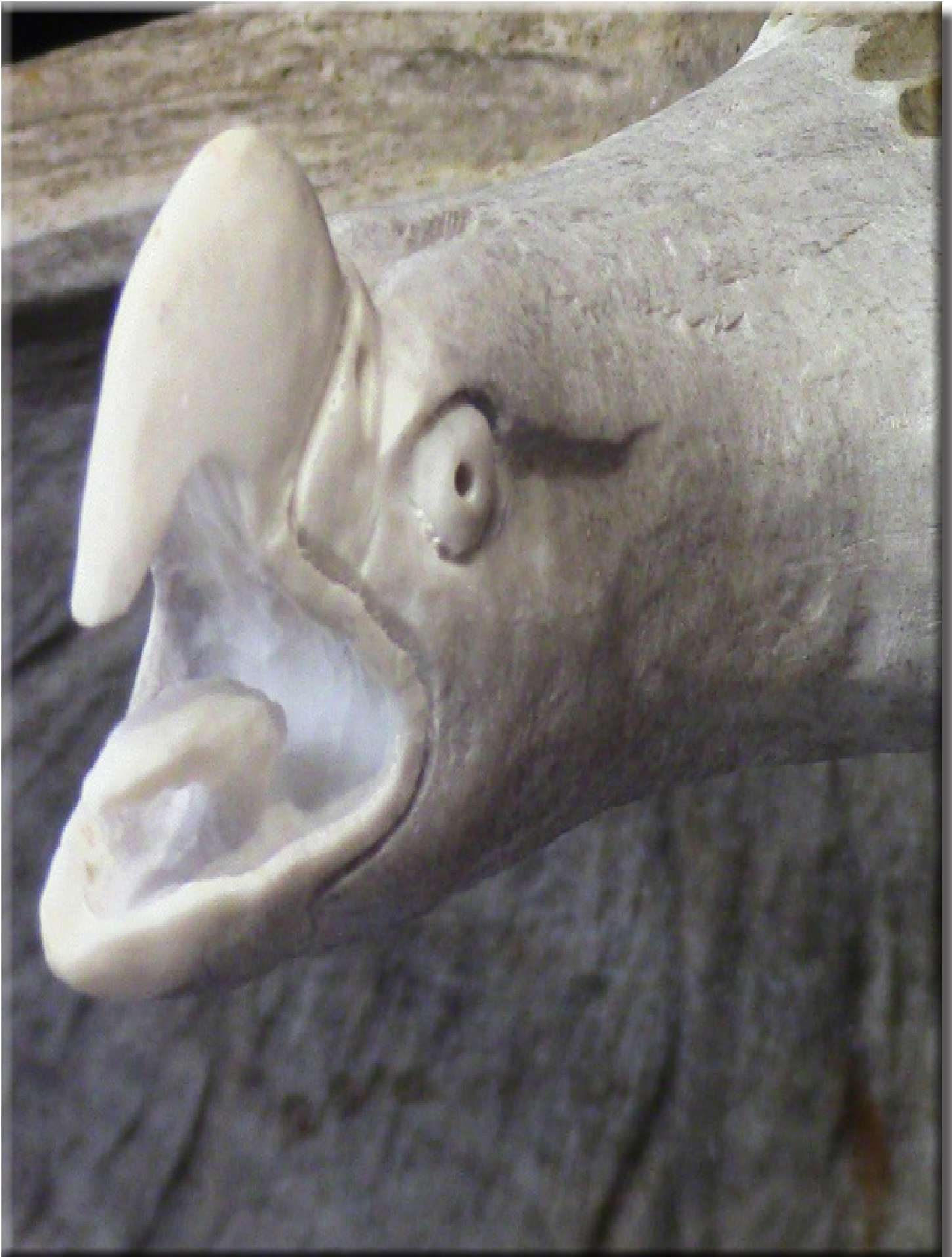
Detail - Moosehorn Eagle