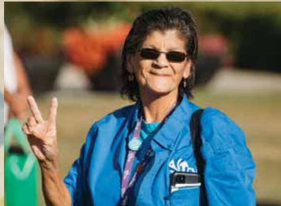
University College of the North recently celebrated 20-years of bringing knowledge to northern Manitoba.

Our Mile 20 cultural event serves as a testament to our commitment to honoring Indigenous culture and learning from our Elders. This outdoor, 2-day camp features land-based learning opportunities that focus on Indigenous language and culture.