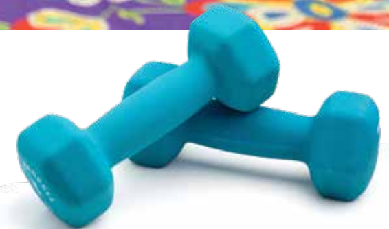
Top quality Fitness Centres on both main campuses.