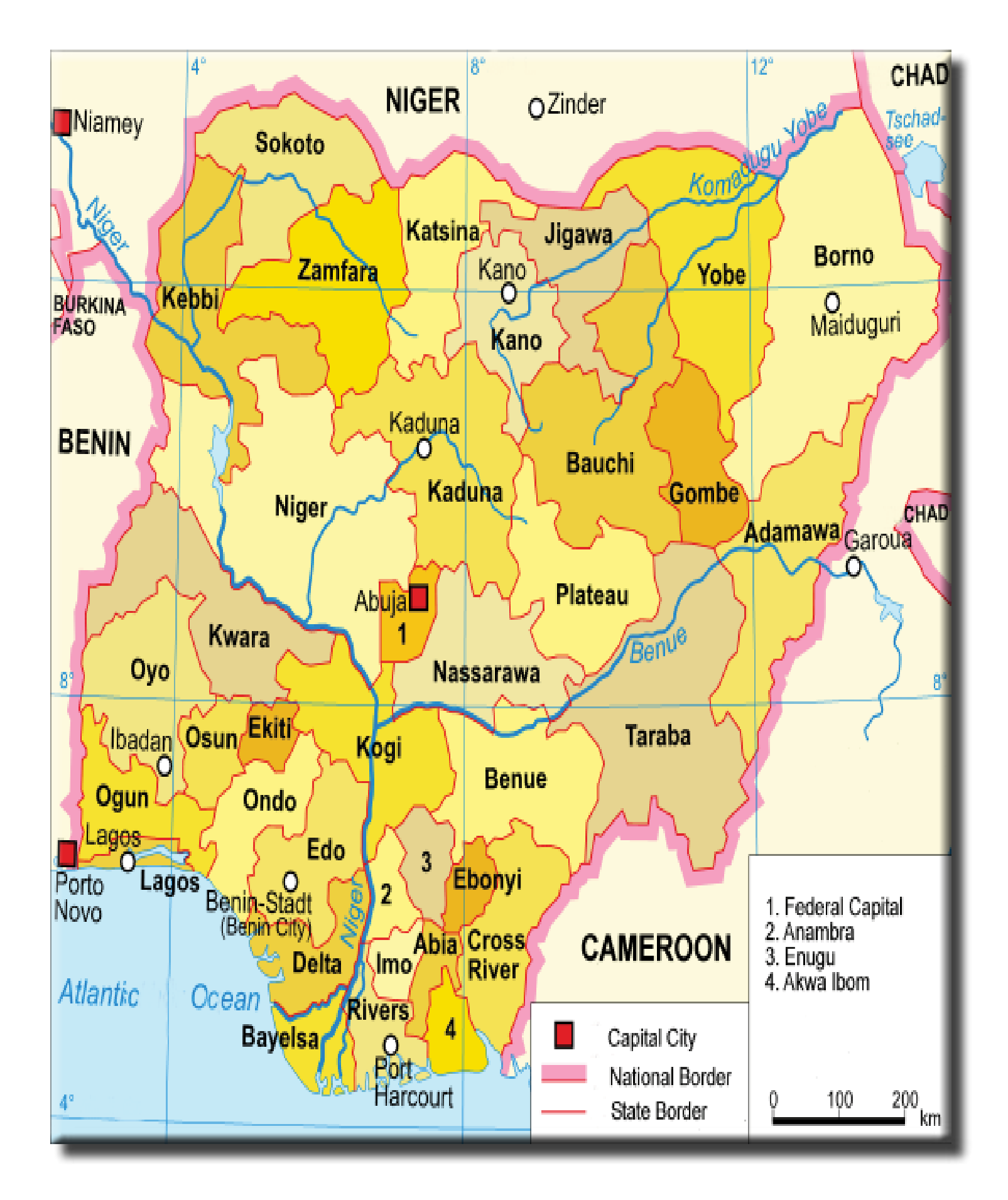
Figure 1: A Clickable Map of Nigeria Showing its 36 States and the Federal Capital Territory

State; Gashaka Gumti National Park in Adamawa and Taraba States; Chad Basin National Park in Bornu and Yobe States; Kainji Lake National Park in Niger and Kwara States; Cross River National Park in Cross River State; Kamuku National Park in Kaduna State; Okomu National Park in Edo State and Old Oyo National Park in Oyo State (Omoera "Potentials of the Television" 119).