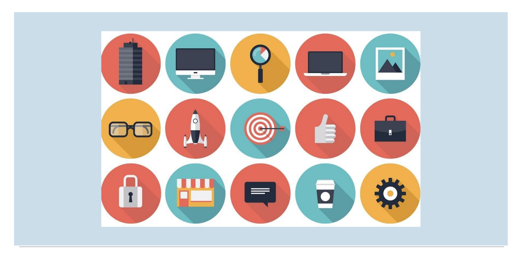
PART B: WHAT YOU WILL NEED TO KNOW AND DO TO CONDUCT RESEARCH RESPONSIBLY