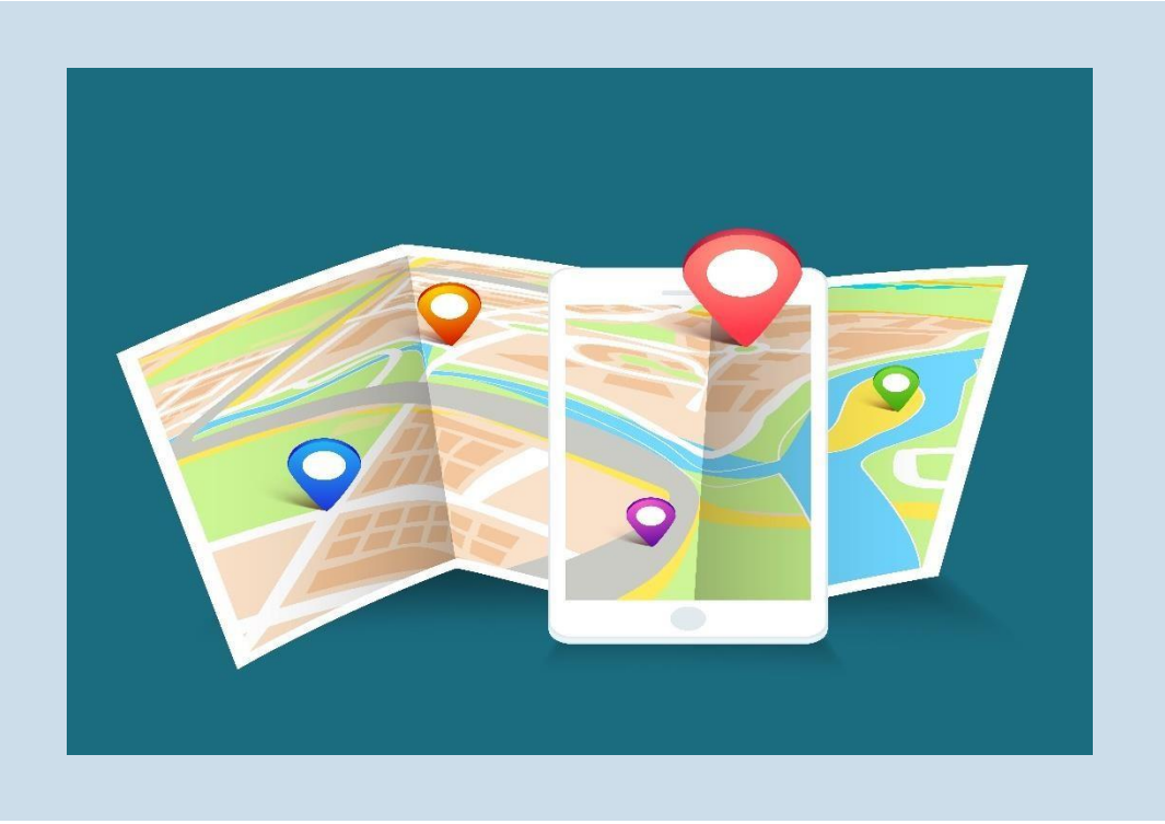
PART D: RESOURCES TO CONTINUE BUILDING YOUR KNOWLEDGE AND PROFICIENCY IN RCR