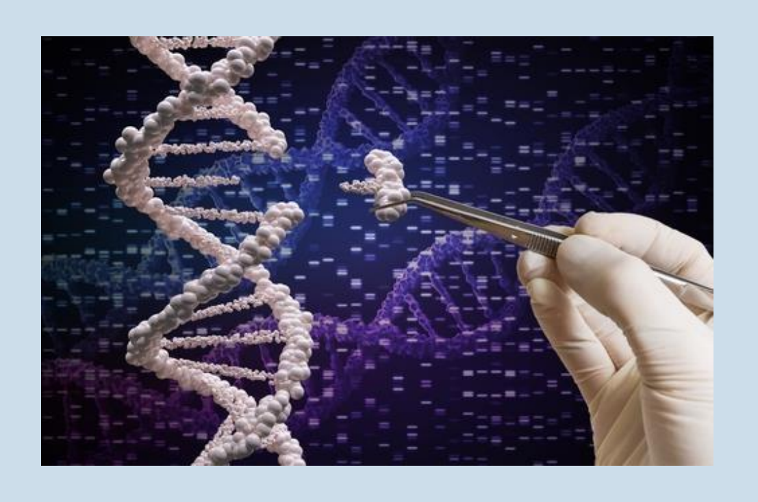
PART C: WHY KNOWING ABOUT AND CONDUCTING RESEARCH RESPONSIBLY IS IMPORTANT