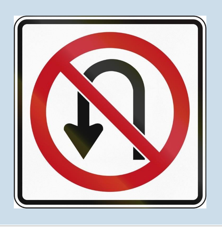
PART A: WHAT NOT TO DO — REAL EXAMPLES DRAWN FROM SOME CANADIAN POST-SECONDARIES